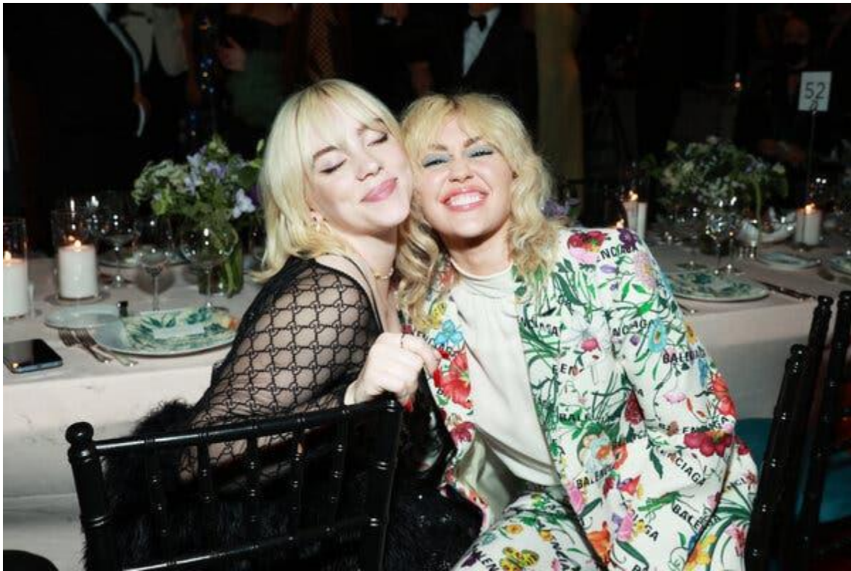
At the LACMA Art+Film gala: Billie Eilish, left, and Miley Cyrus.

The Los Angeles County Museum of Art drew a who's who of Hollywood stars and artists to its 10th annual Art+Film Gala on Nov. 6; the Gucci-sponsored event honored Amy Sherald, Kehinde Wiley and Steven Spielberg. The literary world gathered at the New York Public Library's annual gala on Nov. 8.; this year's Library Lions were Chimamanda Ngozi Adichie, Tina Brown, Jonathan Lethem and Darren Walker. And the Art Dealers Association of America held a preview benefit for the Henry Street Settlement at the Park Avenue Armory on Nov. 3.