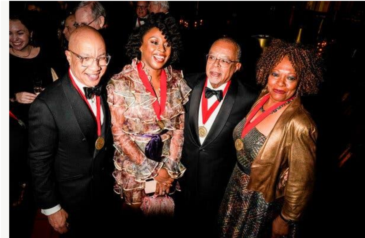
From left: Darren Walker, Chimamanda Ngozi Adichie, Henry Louis Gates Jr. and Rita Dove.