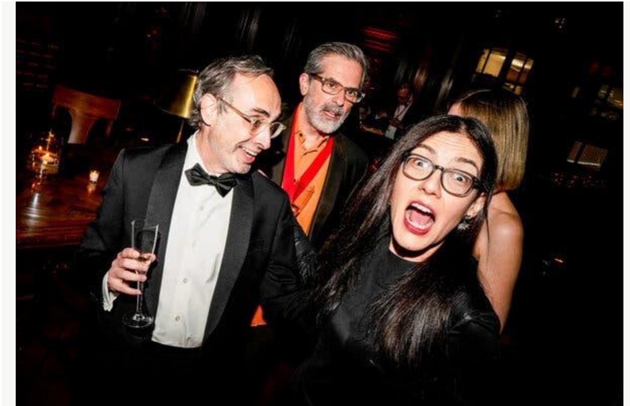
From left: Gary Shteyngart, Jonathan Lethem and Sloane Crosley.