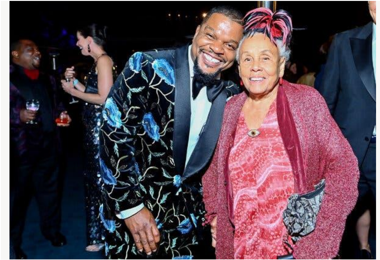
Kehinde Wiley, left, and Betye Saar.