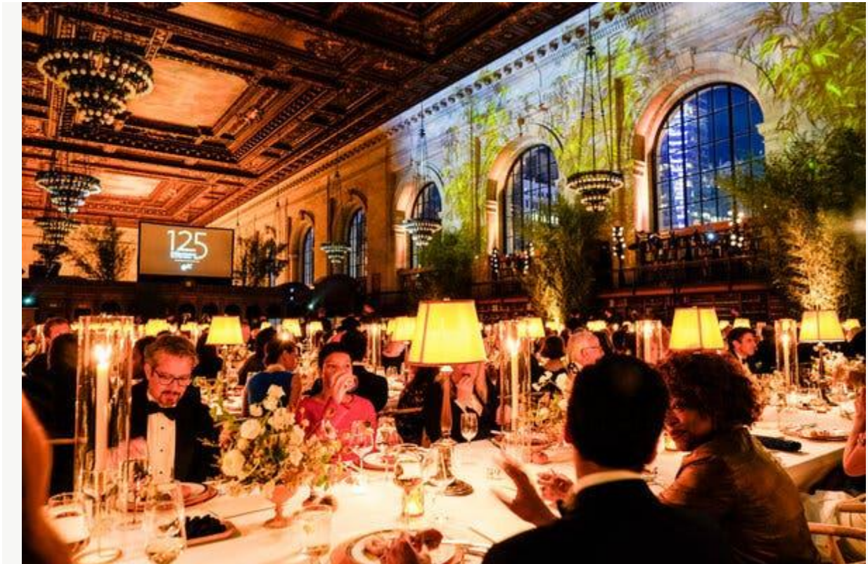
The dinner scene at the New York Public Library's 2021 Library Lions gala.