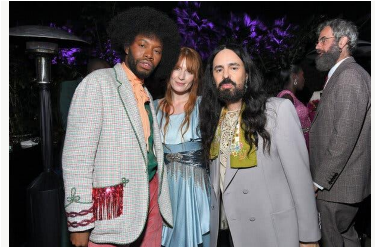
From left: Jeremy O. Harris, Florence Welch and Alessandro Michele.