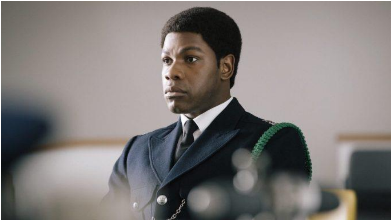
John Boyega in Red, White and Blue.