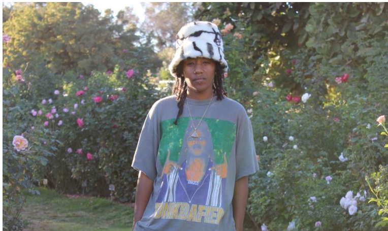
Lauren Halsey.