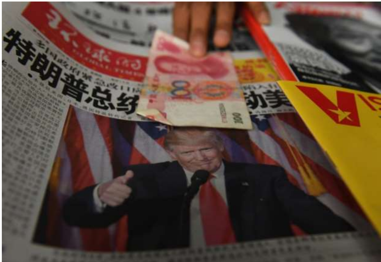
A vendor picks up a 100 yuan note at a news stand in Beijing.

“Stupid,” counterproductive,” “senseless,” and “detrimental.”