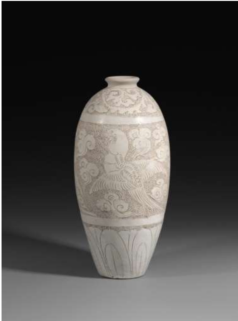
A large engraved white-glazed Cizhou Meiping. Northern Song Dynasty, (A.D. 11th Century). Courtesy of J. J. Lally & Co., New York.